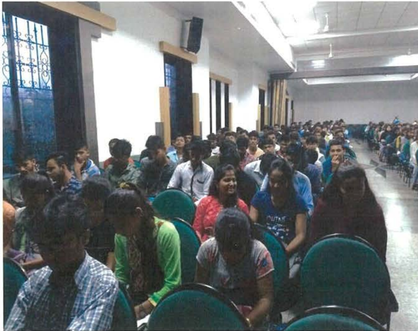
Students during the orientation program