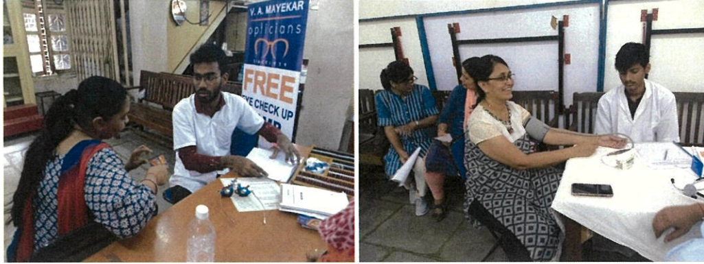
Free Medical check-up for teaching and non-teaching staff organized by Alumni on October 15, 2019

Affiliated to UNIVERSITY OF MUMBAI || NAAC Re-Accredited 'A' Grade (CGPA: 3.50)