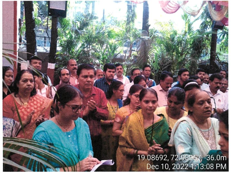
19.08692, 72.90957, -36.0m Dec 10, 2022 1:13:08 PM