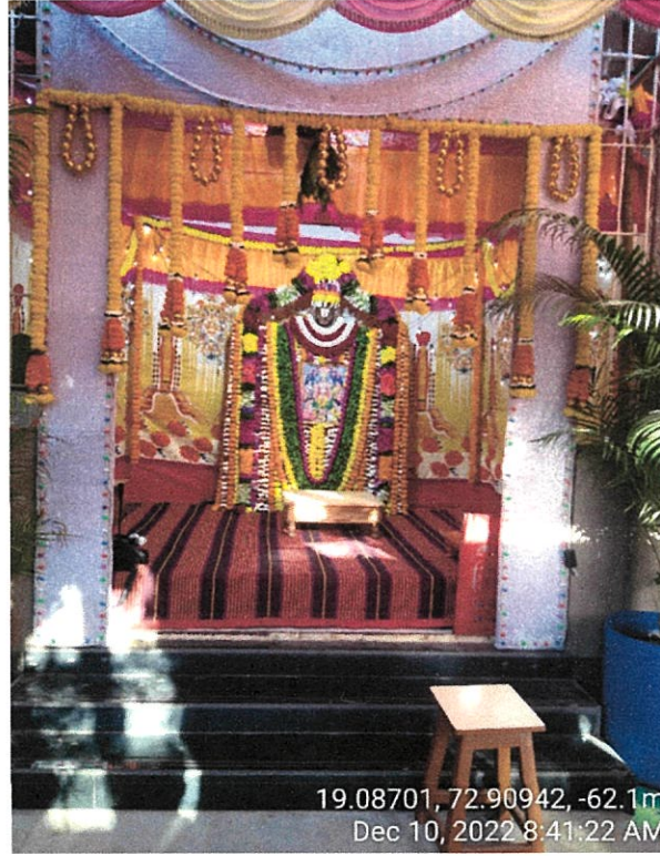
19.08701, 72.90942, -62.1m Dec 10, 2022 8:41:22 AM