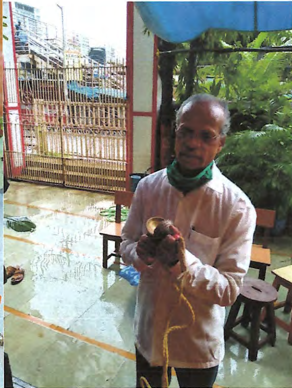
Eco-Friendly Ganesh Festival organized by Non-Teaching Staff of the college 22/08/2020