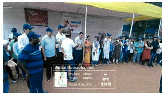
Annual Sports day celebrated on December 24, 2019