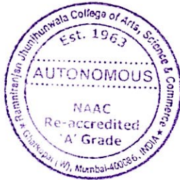
PRINCIPAL RAMNIRANJAN JHUNJHUNWALA COLLEGE OF ARTS, SCIENCE & COMMERCE (AUTONOMOUS) Ghatkopar (W), Mumbai-400086, Maharashtra, INDIA