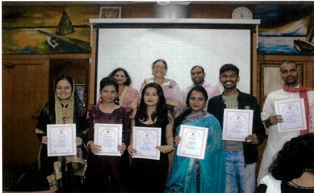
Student participant winners of Philo-Fest