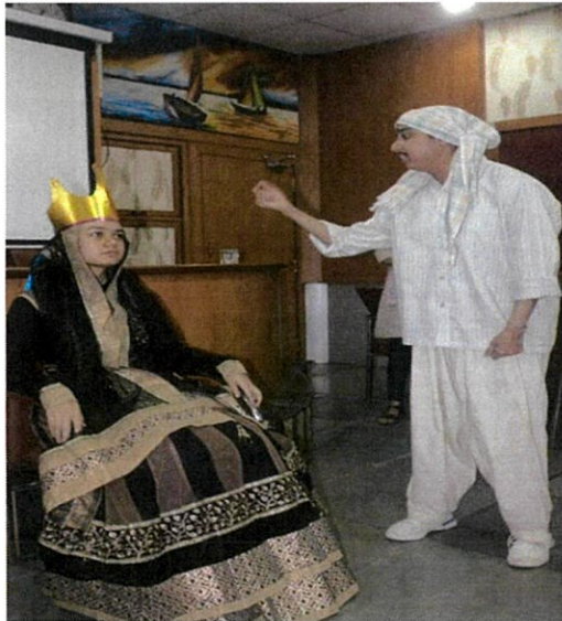
Students performing during Philo-Skit