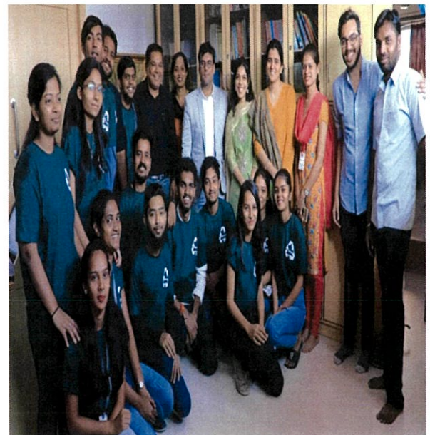
Students and teachers during the departmental fest KARMA' 2019