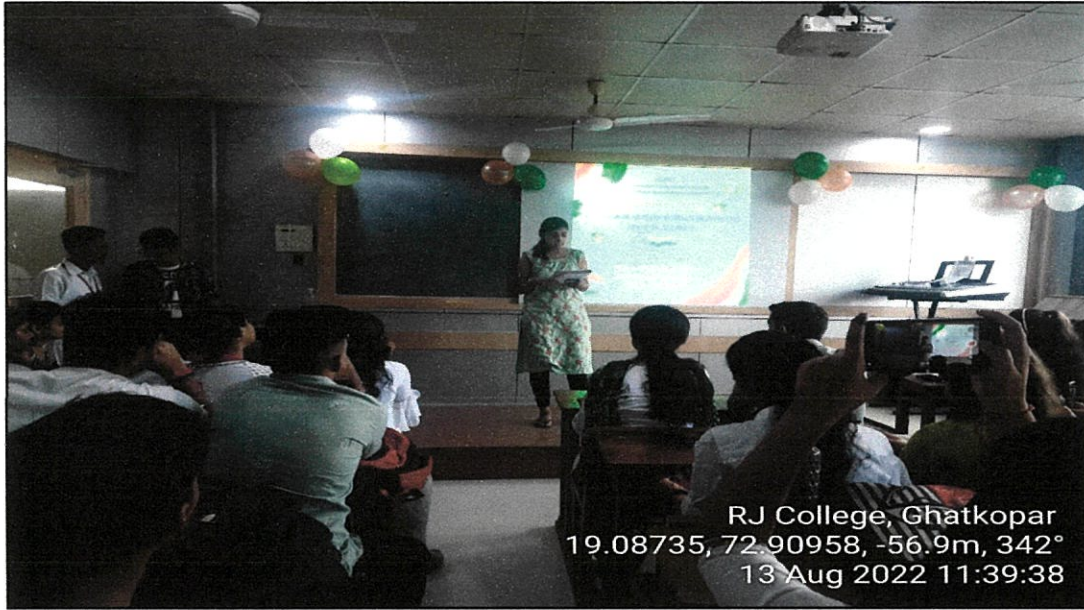
Students performing in various events