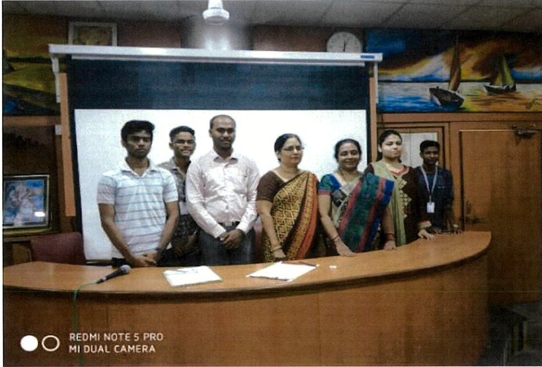
Photo of annual literary Fest -Lit Fiesta: Tell the Tale Event organized by English Literary Association & Hindi Sahitya Parishad

Affiliated to UNIVERSITY OF MUMBAI || NAAC Re-Accredited 'A' Grade (CGPA: 3.50)