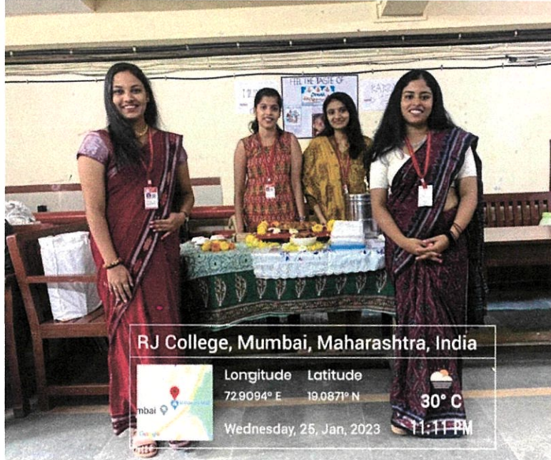
National Tourism Day Celebration, Depts of Economics & History, January 25, 2023