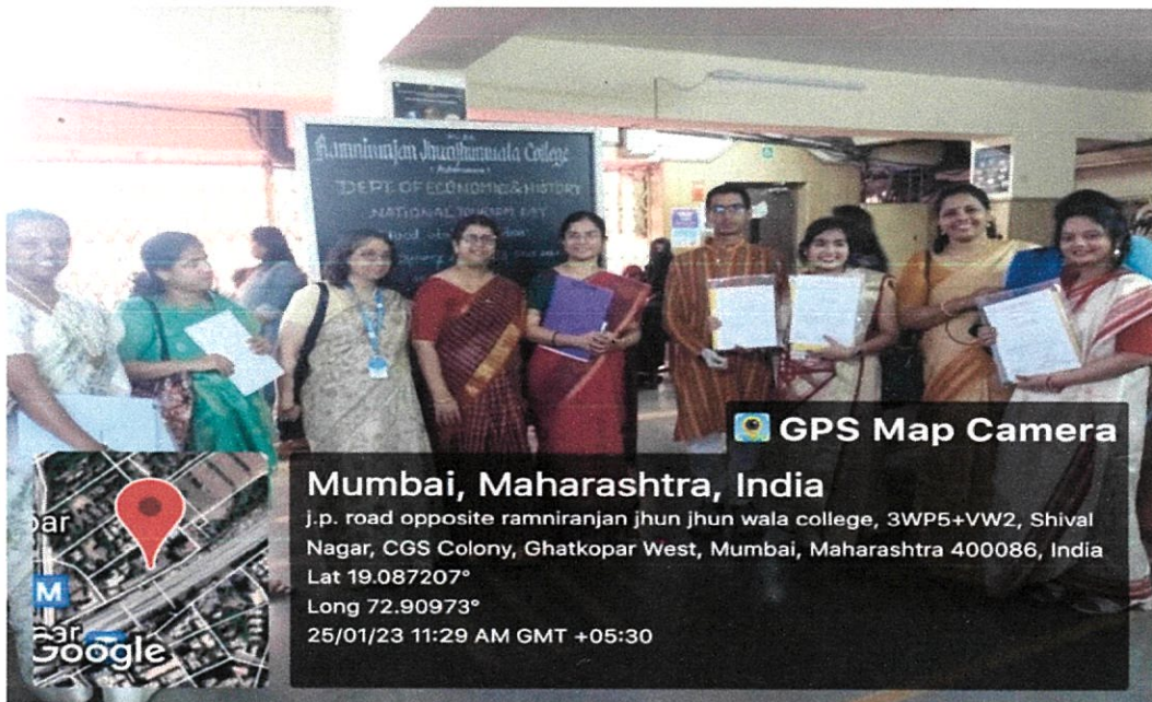
National Tourism Day Celebration, Depts of Economics & History, January 25, 2023