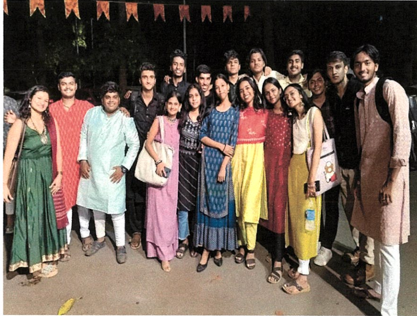
PHOTO OF ROTARACT MEMBERS

Affiliated to UNIVERSITY OF MUMBAI || NAAC Re-Accredited 'A' Grade (CGPA: 3.50)