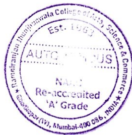
PRINCIPAL RAMNIRANJAN JHUNJHUNWALA COLLEGE OF ARTS, SCIENCE & COMMERCE (AUTONOMOUS) Ghatkopar (W), Mumbai-400 086, Maharashtra, INDIA

Overall, the experience was enjoyable for both the participants and the spectators alike.