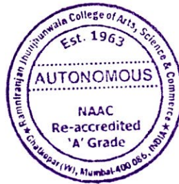
Principal PRINCIPAL RAMNIRANJAN JHUNJHUNWALA COLLEGE OF ARTS, SCIENCE & COMMERCE (AUTONOMOUS) Ghatkopar (W), Mumbai-400 086, Maharashtra, INDIA