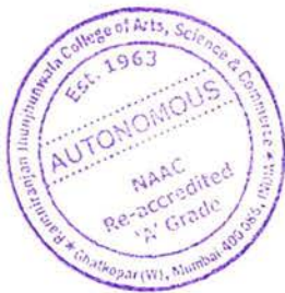
PRINCIPAL RAMNIRANJAN JHUNJHUNWALA COLLEGE OF ARTS, SCIENCE & COMMERCE (AUTONOMOUS) Ghatkopar (W), Mumbai-400 086, Maharashtra, INDIA