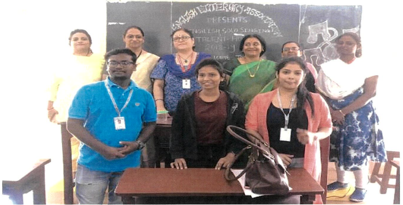
Photo of the event 'English solo singing talent hunt' organized by English literary association on 18 th December 2018.

Affiliated to UNIVERSITY OF MUMBAI || NAAC Re-Accredited 'A' Grade (CGPA: 3.50)