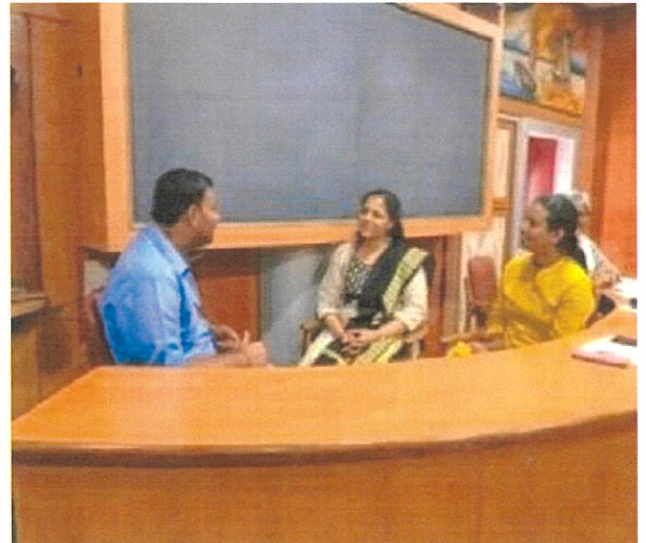
Group discussion and Personal Interview with students

Uale PRINCIPAL RAMNIRANJAN JHUNJHUNWALA COLLEGE OF ARTS, SCIENCE & COMMERCE (AUTONOMOUS) Ghatkopar (W), Mumbai - 400 086, Maharashtra, INDIA