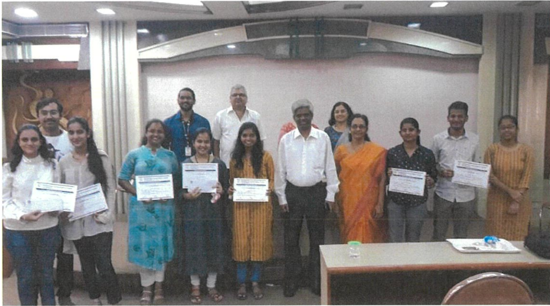
'VISUAL STORYTELLING' An Intercollegiate Power Point Presentation Competition on November 15, 2019