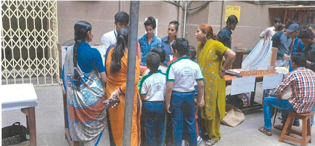
Photos of MatheMagica2020, 08 January 2020

Affiliated to UNIVERSITY OF MUMBAI || NAAC Re-Accredited 'A' Grade (CGPA: 3.50)