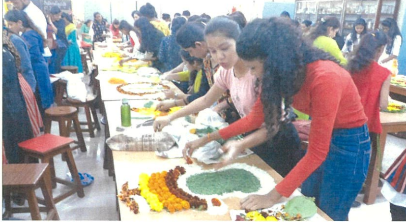
Students during the floral rangoli competition