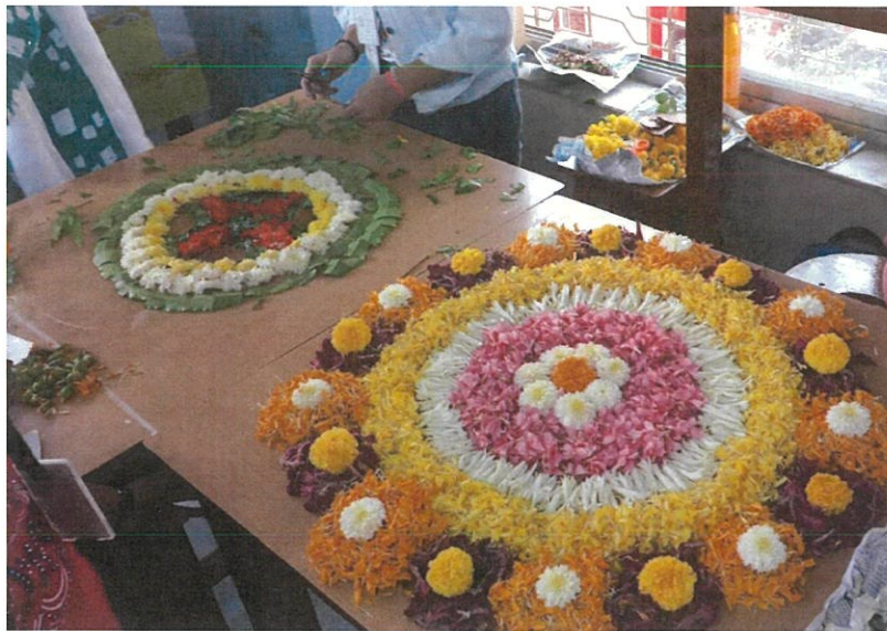
Floral rangoli displayed.