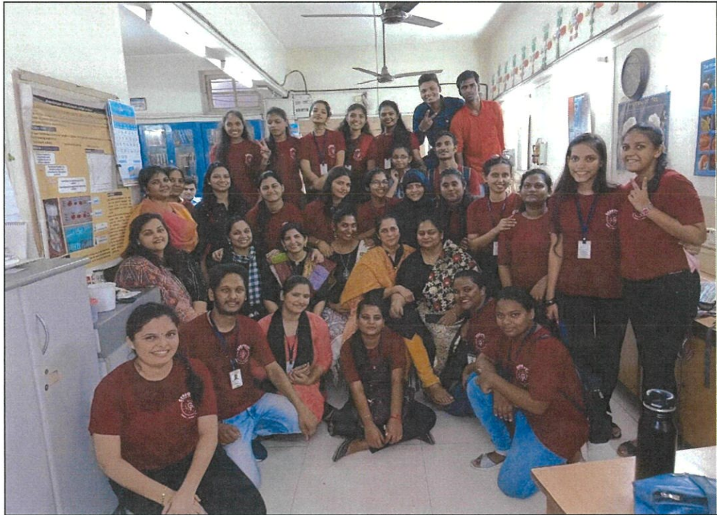
Biotechnology Second Year Students- Team Geneopsis who organized the departmental Fest -Geneopsis on 16th December 2019.

Affiliated to UNIVERSITY OF MUMBAI || NAAC Re-Accredited 'A' Grade (CGPA: 3.50)