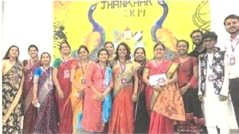
cultural association teaching members and student volunteers