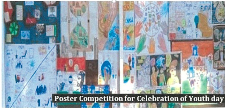
Poster Competition for Celebration of Youth day

Affiliated to UNIVERSITY OF MUMBAI || NAAC Re-Accredited 'A' Grade (CGPA: 3.50)