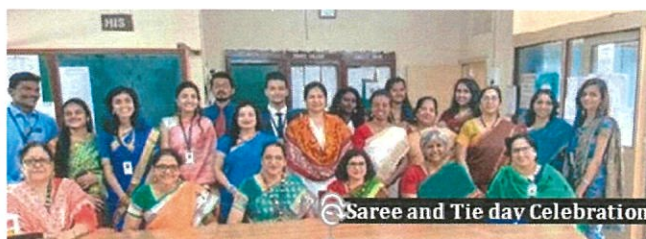
Celebration of Pink Day, Saree and Tie day