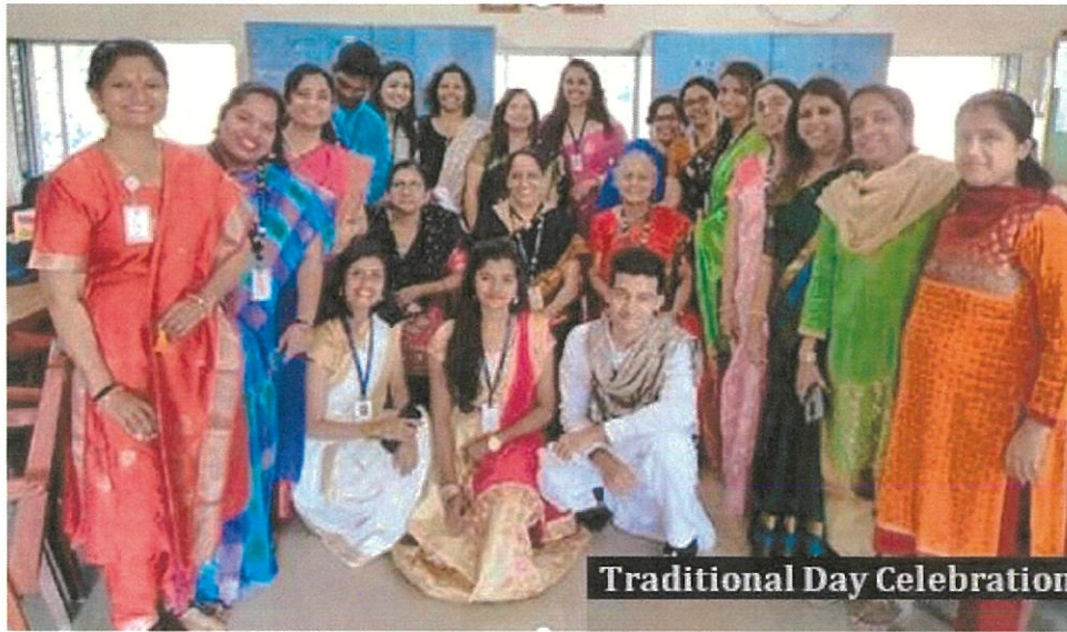
Traditional Day Celebration