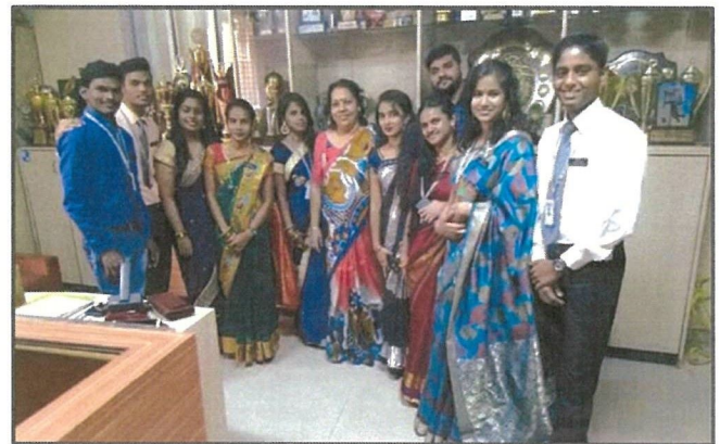
Students' Council Members and teachers during various events