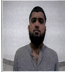
Test Day Photo