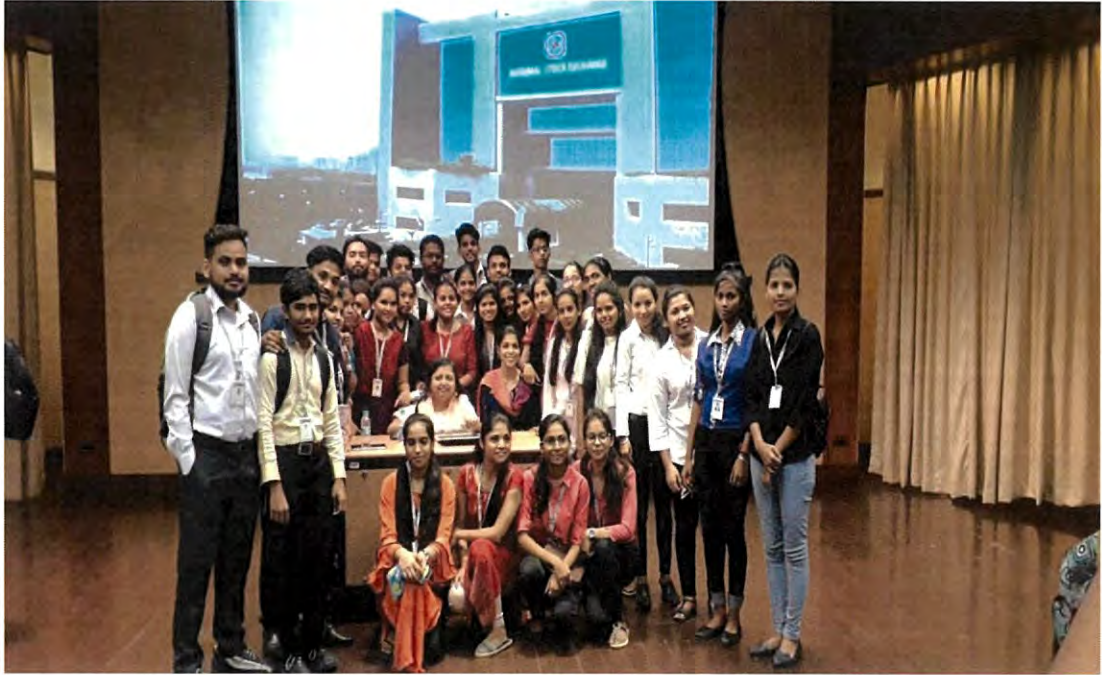
PHOTOGRAPH OF THE VISIT TO NSE HELD ON 25 TH FEBRUARY 2019

Affiliated to UNIVERSITY OF MUMBAI || NAAC Re-Accredited 'A' Grade (CGPA: 3.50)