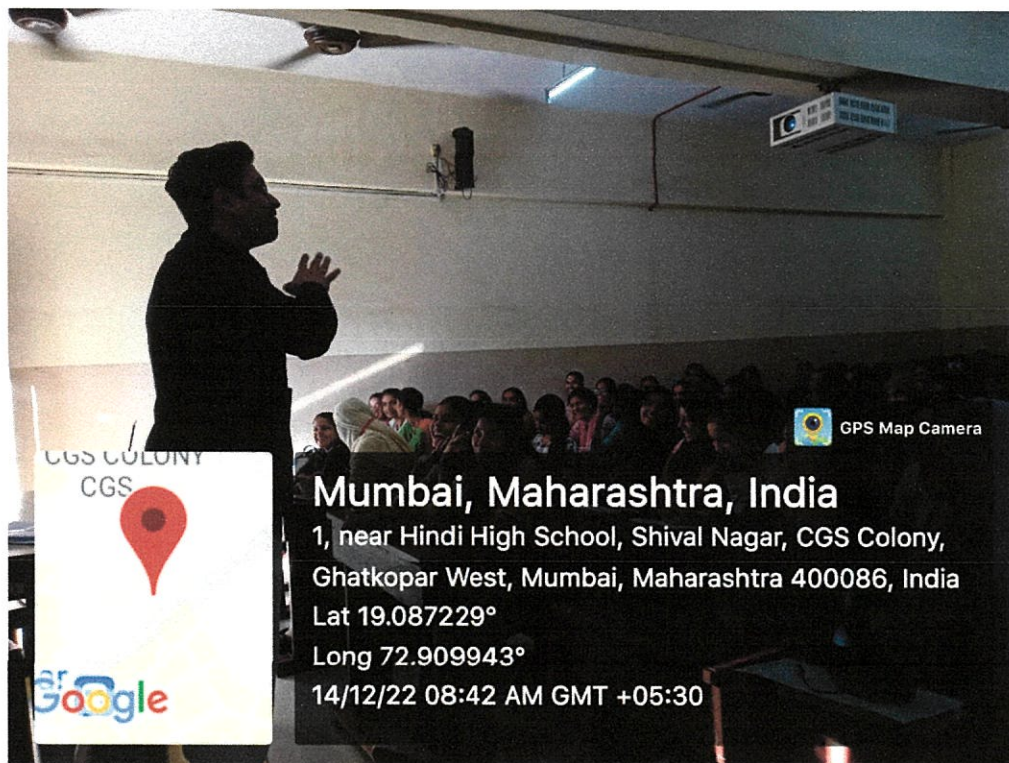
Students during the session on insurance

Opposite Ghatkopar Railway Station, Ghatkopar J.P. Road, 3WP5+VWP, Shival Nagar, CGS Colony, Pant Nagar, Ghatkopar West, Mumbai, Maharashtra 400086, India Lat 19.087208° Long 72.909876° 14/12/22 08:49 AM GMT +05:30