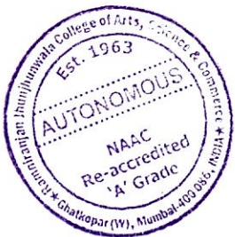
PRINCIPAL RAMNIRANJAN JHUNJHUNWALA COLLEGE OF ARTS, SCIENCE & COMMERCE (AUTONOMOUS) Ghatkopar (W), Mumbai-400 086, Maharashtra, INDIA

Achievements: Taken at least 1 promotion in every assignment and still in contact with customers from 1st assignment which is very important in sales.