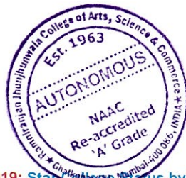
Principal RAMNIRANJAN JHUNJHUNWALA COLLEGE OF ARTS, SCIENCE & COMMERCE (AUTONOMOUS) Ghatkopar (W), Mumbai-400086, Maharashtra, INDIA