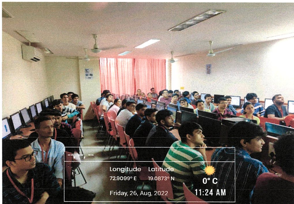
Students during the session