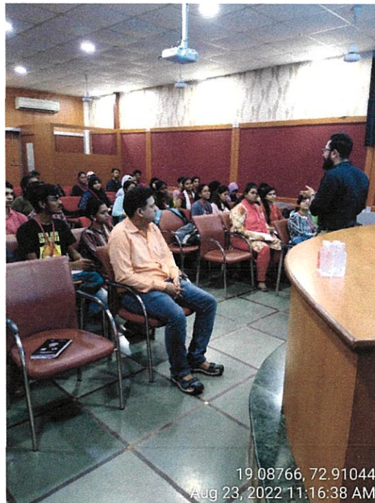
Students and teachers during the session