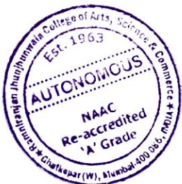
PRINCIPAL RAMNIRANJAN JHUNJHUNWALA COLLEGE OF ARTS, SCIENCE & COMMERCE (AUTONOMOUS) Ghatkopar (W), Mumbai-400 086, Maharashtra, INDIA

Brief Description of the event: The event was all about Kitchen Gardening And which types of plants can be used to grow if one is planning to have kitchen garden. Different ways to take care of that plants was also be taught. Overall the event was amazing.