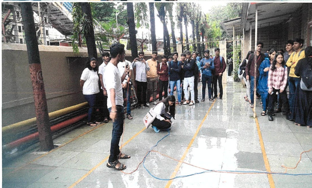
Students enacting a skit