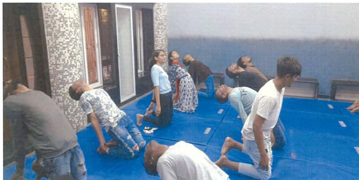
Non-Teaching staff members during the session