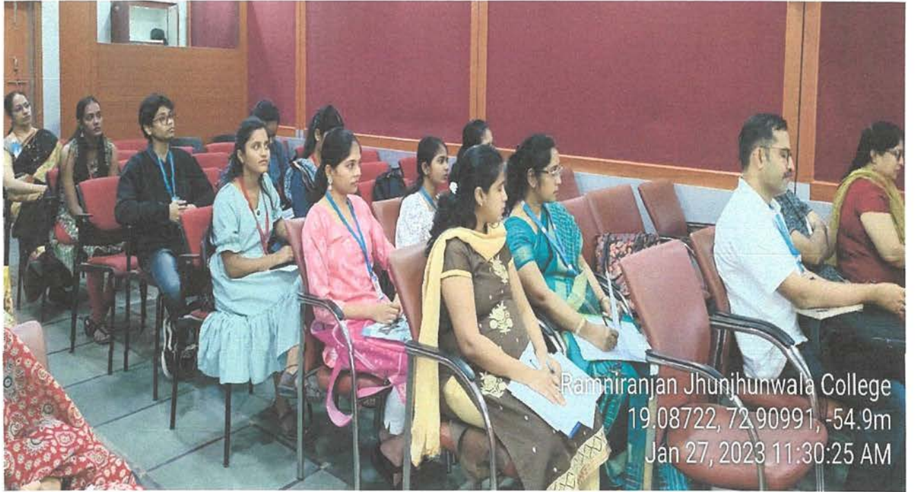
Students listening to book Appreciation in Pustakgappaa on 27/01/2023

Affiliated to UNIVERSITY OF MUMBAI || NAAC Re-Accredited 'A' Grade (CGPA: 3.50)