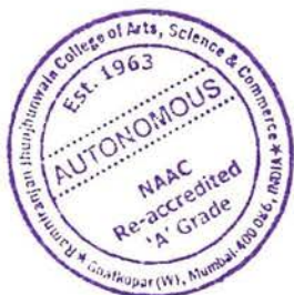
PRINCIPAL R. J. COLLEGE OF ARTS, SCIENCE & COMMERCE (AUTONOMOUS) Ghatkopar (W), Mumbai-400 086, Maharashtra, INDIA

The guest speaker provided the students with information regarding the types of Elasmobranchs that are found in the water off the country's coastline (with the focus on Mumbai and Maharashtra) such as sharks, rays and skates, the importance of their role within the ecosystem, threats faced by these species as well as the conservation activities undertaken by the Foundation in collaboration with the fishing communities.