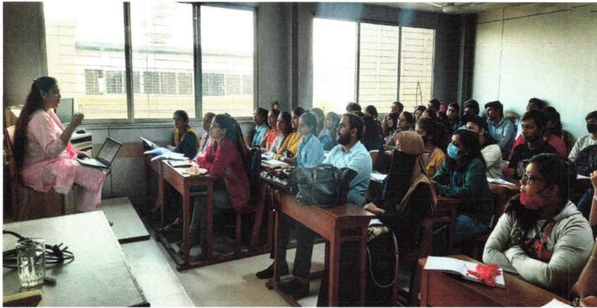
Photographs of the event:

Affiliated to UNIVERSITY OF MUMBAI || NAAC Re-Accredited 'A' Grade (CGPA: 3.50)