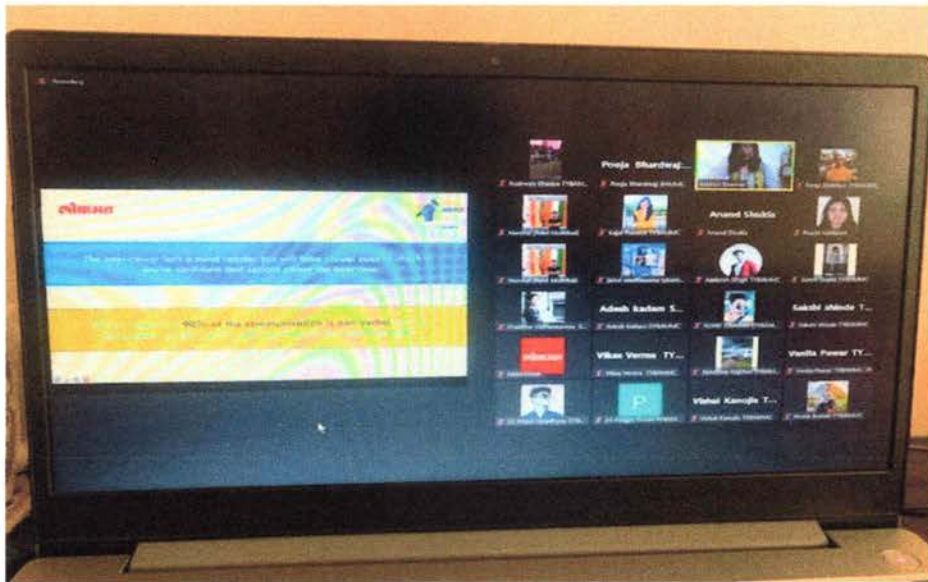
Photographs of the Session:

Affiliated to UNIVERSITY OF MUMBAI || NAAC Re-Accredited 'A' Grade (CGPA: 3.50)