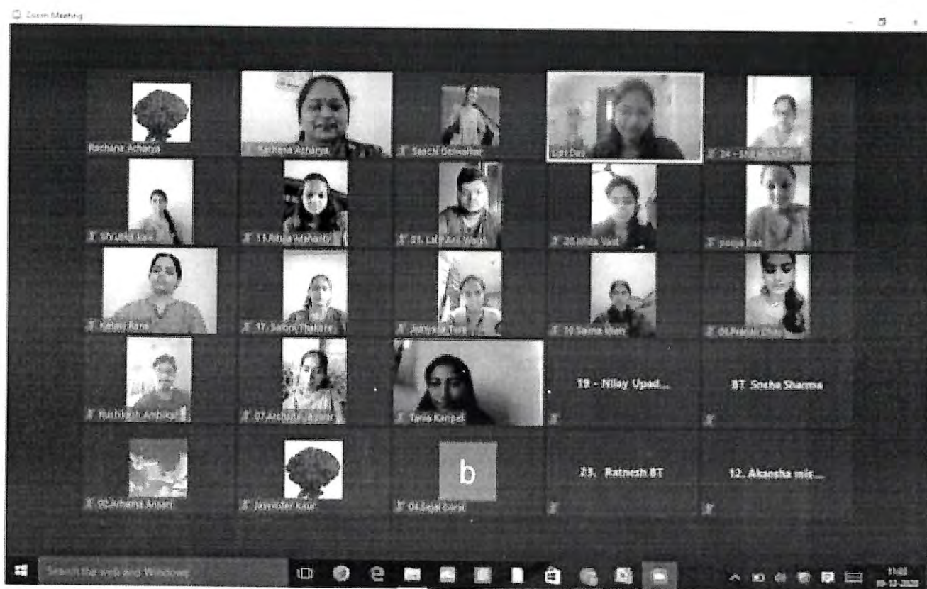
Fig1: Screenshot of Online lecture series-Gyan Vigyan: Lecture VI- Three days Guest lecture series on “X-ray Crystallography” organised by Biotechnology Department on December 19th, 21st & 22nd 2020.

Affiliated to UNIVERSITY OF MUMBAI || NAAC Re-Accredited 'A' Grade (CGPA: 3.50)