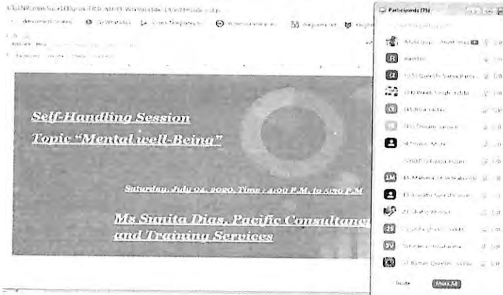
Snap Shot of the session on Self Handling session

Affiliated to UNIVERSITY OF MUMBAI || NAAC Re-Accredited 'A' Grade (CGPA: 3.50)