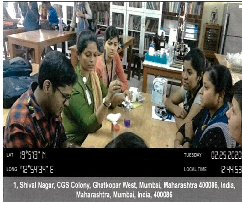
Awareness campaign for 'Prevention of spread of dreadful diseases' - 25/02/2020