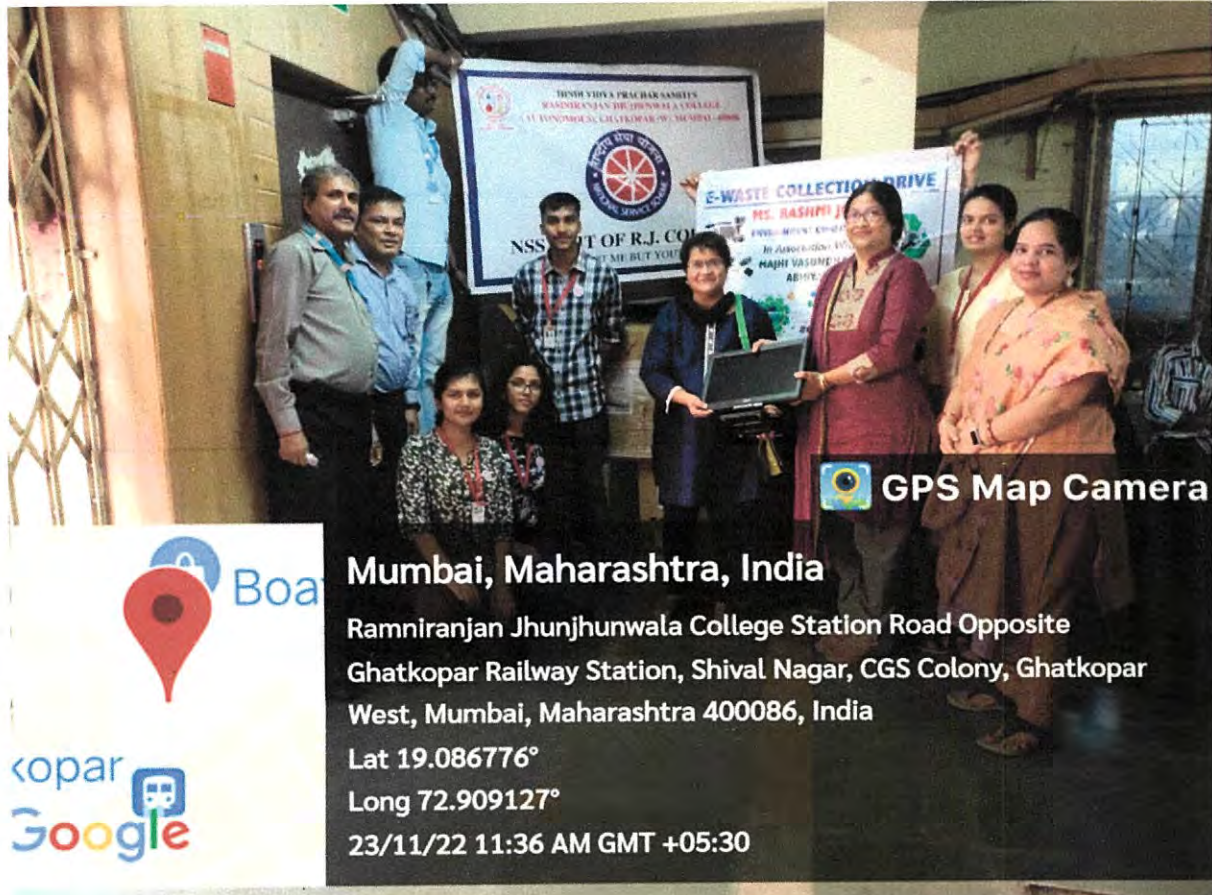
Handing of collected e-waste by NSS and NCC Unit of RJ College