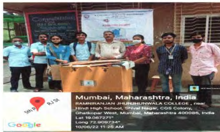
Collection on 10 th June, 2022