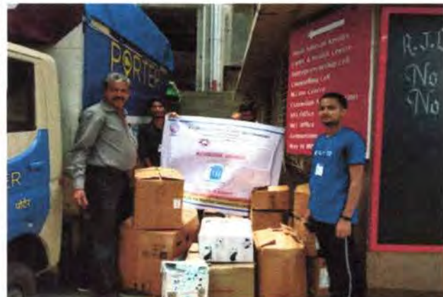
Collection on 18 th February, 2022