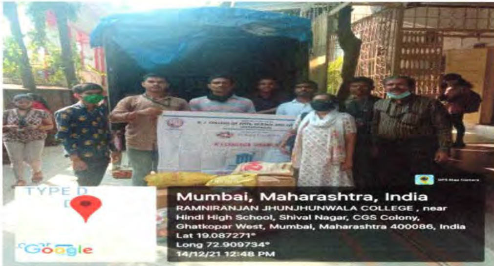
Collection on 14 th December, 2021

Affiliated to UNIVERSITY OF MUMBAI II NAAC Re-Accredited 'A' Grade (CGPA: 3.50)