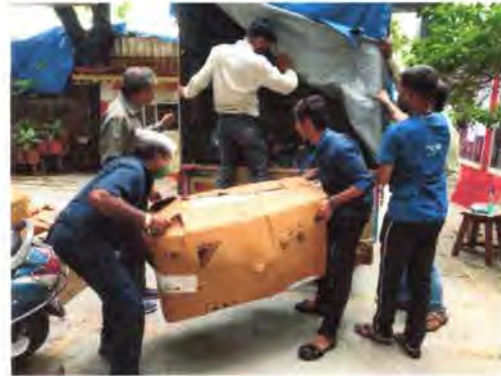
Collection on 20 th July, 2021