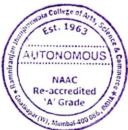
PRINCIPAL RAMNIRANJAN JHUNJHUNWALA COLLEGE OF ARTS, SCIENCE & COMMERCE (AUTONOMOUS) Ghatkopar (W), Mumbai-400 086, Maharashtra, INDIA