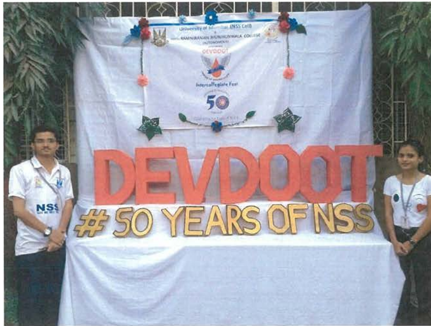
Street play by NSS volunteers on "Devdoot" February 7 th and 8 th , 2019

Affiliated to UNIVERSITY OF MUMBAI || NAAC Re-Accredited 'A' Grade (CGPA: 3.50)