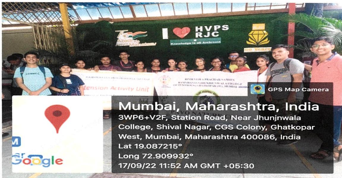
Student volunteers of DLLE and Pavo Nature Club who participated in the clean-up drive