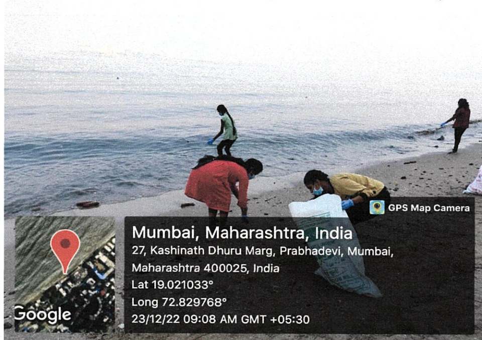
Students cleaning Dadar beach.