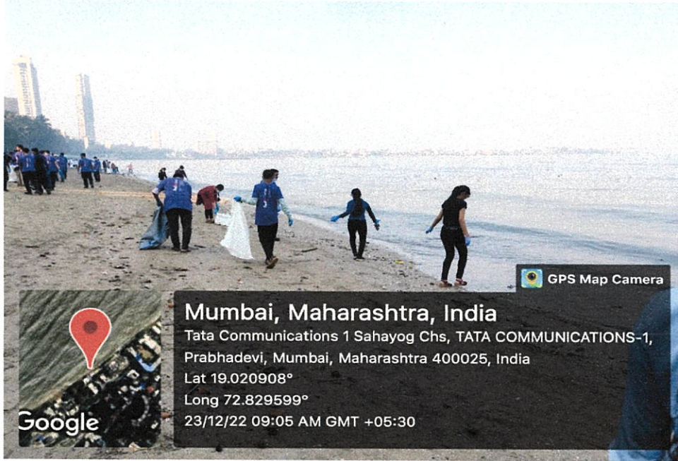
Students while assisting volunteers during the Dadar Beach cleaning drive.