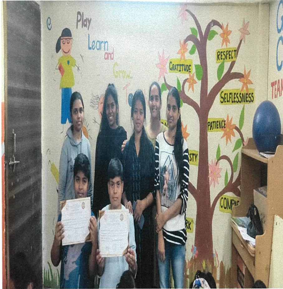
PHOTO OF THE WINNERS OF HANDWRITING COMPETITION