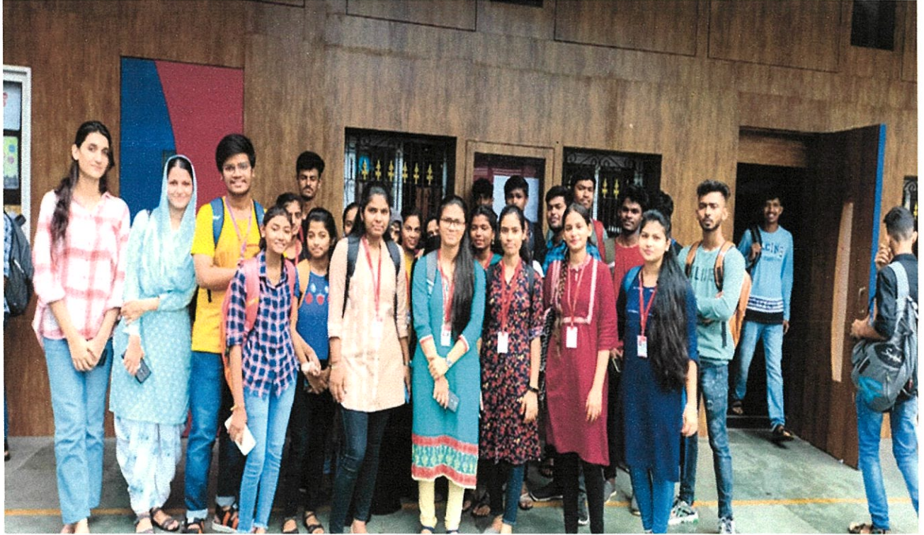
PHOTO OF THE WORLD PHOTOGRAPHY COMPETITION PARTICIPANTS

Affiliated to UNIVERSITY OF MUMBAI || NAAC Re-Accredited 'A' Grade (CGPA: 3.50)