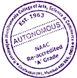
PRINCIPAL RAMNIRANJAN JHUNJHUNWALA COLLEGE OF ARTS, SCIENCE & COMMERCE (AUTONOMOUS) Ghatkopar (W), Mumbai-400 086, Maharashtra, INDIA

On August 6, 2022, a poster-making competition on The effects of Gaming and social media was organized for school children at Hindi High School, Ghatkopar. 127 students participated in this competition.