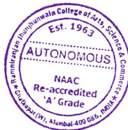
Principal PRINCIPAL RAMNIRANJAN JHUNJHUNWALA COLLEGE OF ARTS, SCIENCE & COMMERCE (AUTONOMOUS) Ghatkopar (W), Mumbai-400 086, Maharashtra, INDIA